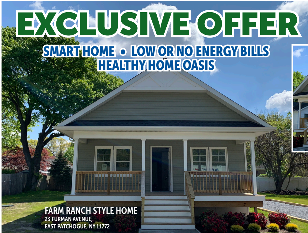
FARM RANCH STYLE HOME 23 FURMAN AVENUE, EAST PATCHOGUE, NY 11772

SMART HOME • LOW OR NO ENERGY BILLS HEALTHY HOME OASIS